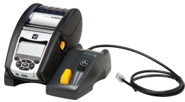
Single-bay QLn Ethernet Cradle