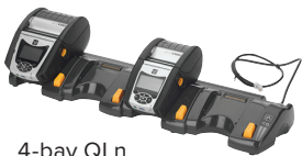
4-bay QLn Ethernet Cradle

Connect QLn printers to your wired Ethernet network via the QLn Ethernet cradle to enable easy remote management by your IT or operations staff — helping to ensure each printer is operating optimally and ready for use. The Ethernet cradle can communicate over 10 mbps or 100 mbps networks using auto-sense.