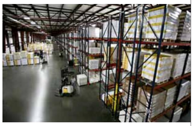
WOW's ever-changing warehouses with solid steel racks is filled with millions of pounds of cheese and paper created untenable RF issues.

WOW material handlers, forklift drivers, and truck loaders depend on Wi-Fi to make their warehouse processes more efficient by gaining universal access to real-time inventory information and eliminating counting and picking errors. The devices are used for a variety of purposes such as scanning palette and product locations, clocking hours, tracking product movements, tow motor inspection, trailer inspections, driver signatures, calendar entries, and MSDS tracking.