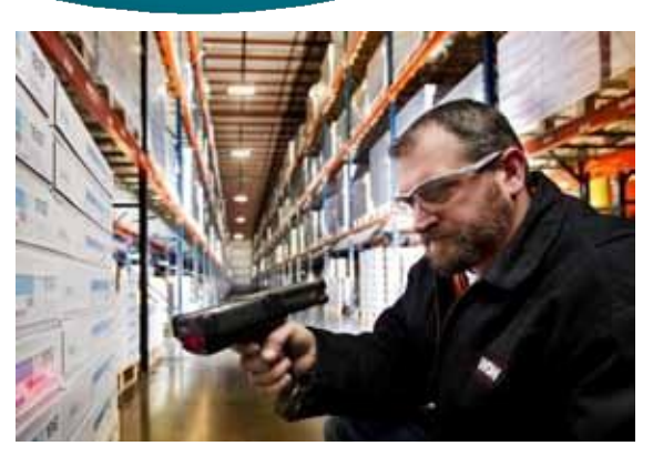
WOW needed a stronger Wi-Fi network that could deliver better service to 98 Wi-Fi-enabled Motorola bar code scanners and 40 badges used for inventory management.

However the price points for the Cisco, Aruba, and Motorola APs and the licensing costs were "outrageously" expensive with the most costly option being 68% higher than the Ruckus system. Because Ruckus uses a high-gain, directional adaptive antenna array integrated into every AP, its system typically requires 30 to 40% fewer APs. And it wasn't just the cost of the APs that was giving Christianson sticker shock.