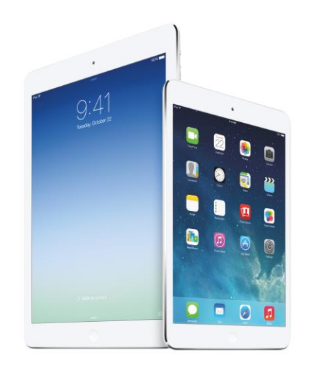
Customer-facing Task Worker

Corporate Owned Business concern: Productivity: Mission Critical