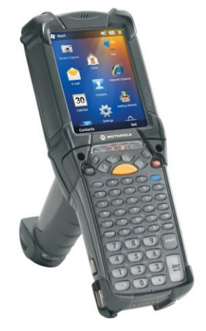
Operational Task Worker

Corporate Owned Business concern: Productivity: Mission Critical