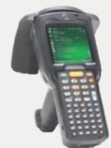
FI BUSINESS-CLASS Motorola MC3190-Z