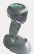
PRESENTATION Motorola DS9808-R