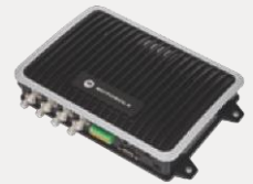
FIXED INDUSTRIAL-CLASS Motorola FX9500