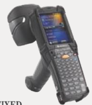
FIXED INDUSTRIAL-CLASS Motorola MC9190-Z