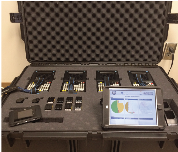
Rodney Bohach created a kit for the equipment he uses to perform an inventory, which includes four CSL101 UHF handheld readers, an iPad Mini for accessing and editing database during inventory, and spare batteries.

reports, including fewer person hours spent inventorying the 16,900 items, clear oversight over the college's assets, and a clear path to future enhancements.