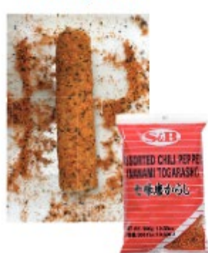
6. Drizzle spicy sauce,